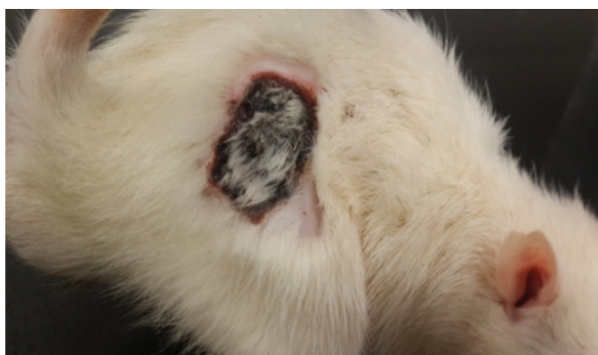
Figure 1. A lesion at the back skin of a subject in group 5

In half of the cases, there were changes secondary to bacterial infection (purulent exudate collection, bacteria cluster, prominent dermal edema and neutrophil infiltration). These changes were also present in subcutaneous tissue. Non-complicated cases showed subcutaneous vascular thrombosis, epidermal and dermal necrosis, hyalinization in the dermal collagen, mild perivascular lymphocyte infiltration, and basal epidermal separation in the epithelia that located around the ulcer (Figure 2). The histopathologic examination of lesions was compatible with injection site cutaneous aseptic necrosis.