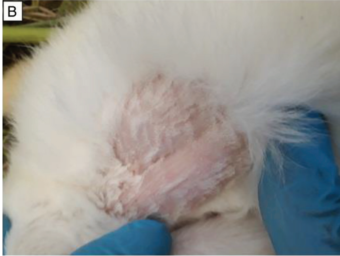
Figure 2. Treatment of infected rabbit with inactivated vaccine. A) Rabbit with dermatophytosis lesions before treatment. B) Rabbit with cure of infection after 8 days of treatment

introduce a solution to decrease these disadvantages and also to limit the transfer of dermatophytes between humans and animals.<sup>7,34</sup> However, increasing the immune response against dermatophytosis can be a key to limiting the toxicity and virulence effects of this disease.<sup>35</sup> Recently, many studies have attempted to enhance the prophylactic action of the antifungal vaccine by stimulating cellular immunity to increase the immunization rate against dermatophytosis.<sup>8</sup> This has been achieved by using specific antigens of a dermatophyte, especially those from Trichophyton spp., to provide stronger immunization than it can gain from inactive vaccine.<sup>7-8</sup> Although no vaccine has a license for commercial use against dermatophytosis, some countries, such as Norway, immunize their cattle with a vaccine against Trichophyton verrucosum as a strategy to control dermatophytosis.<sup>7</sup> The company Biocan M plus in the Czech Republic also produces an unlicensed vaccine from inactivated Microsporumcanis for the treatment of dogs against dermatophytosis.<sup>26</sup>